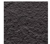
Riga Pattern+ Rock