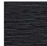
Riga Pattern+ Slatewood